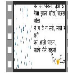
येरे येरे पावसा

Our teachers began preparing and sending 5 videos each to the junior and senior kindergarten groups since the 15 th of June. Each video is between 30-60 seconds.