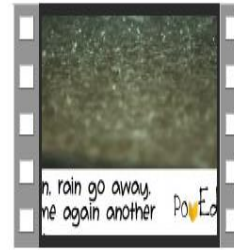
Rain rain go away