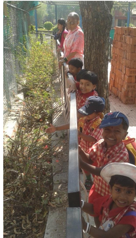
Picnic to the Snake Park