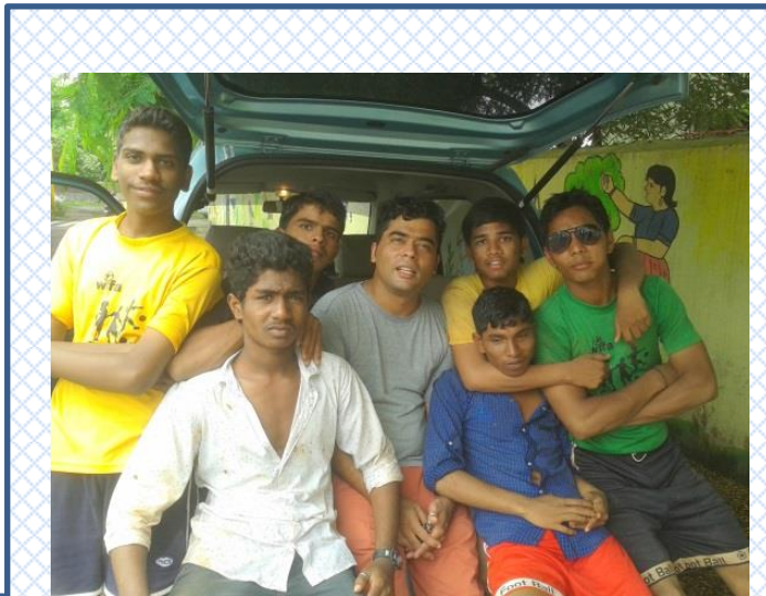
At the Monsoon Football Match