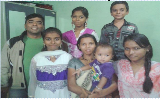
With a group of donors to the project