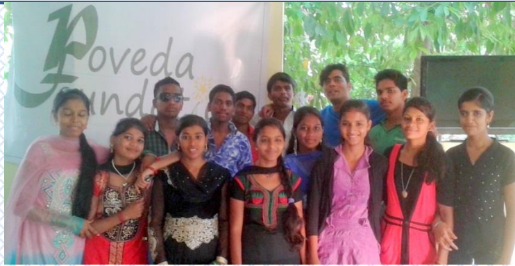
At the Poveda Conferral 2014-15