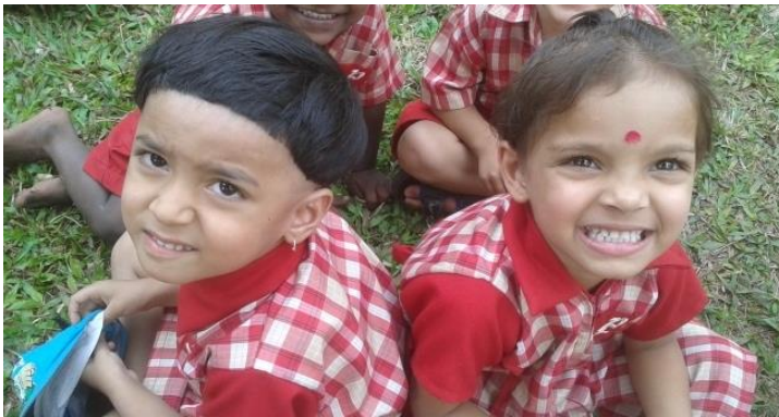
Picnic to the Water Park