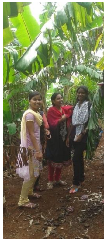
At the farm house