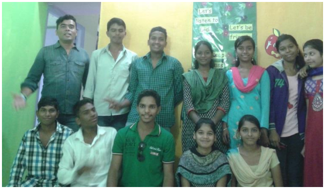
Regular meetings with our teenagers